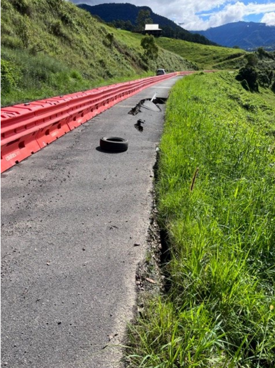
Figure 7 - Zara Road