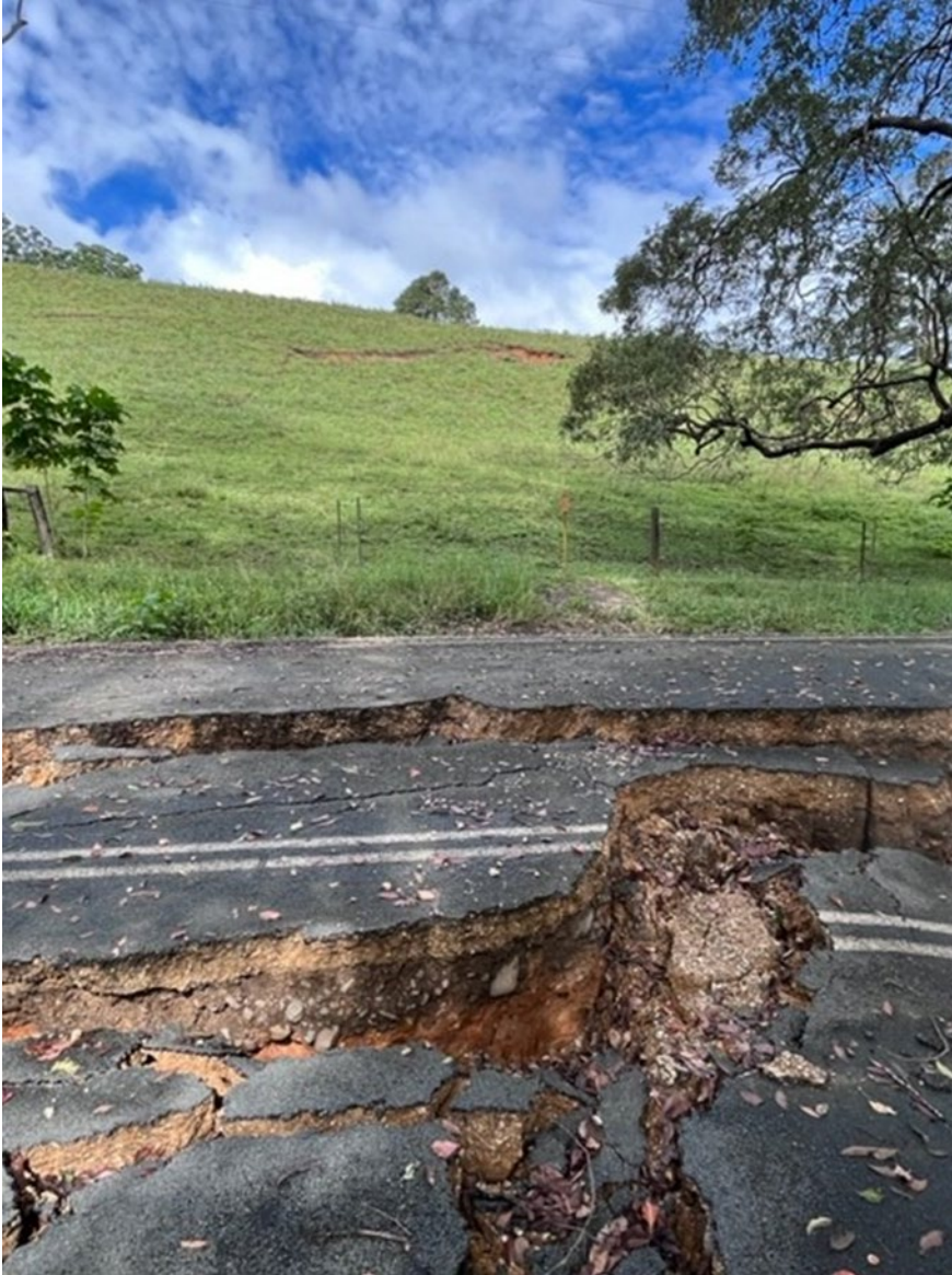
Figure 3 - Tyalgum Road