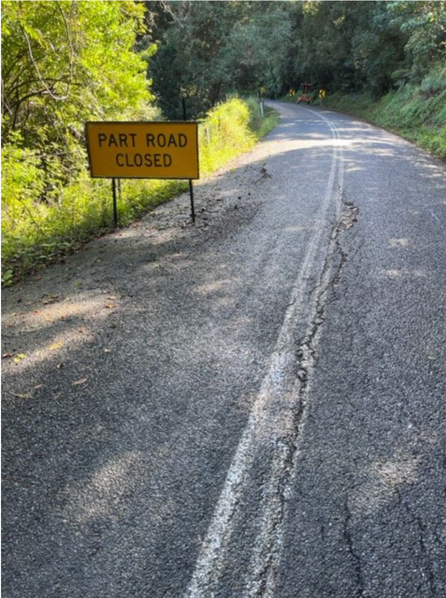
Figure 5 - Numinbah Road