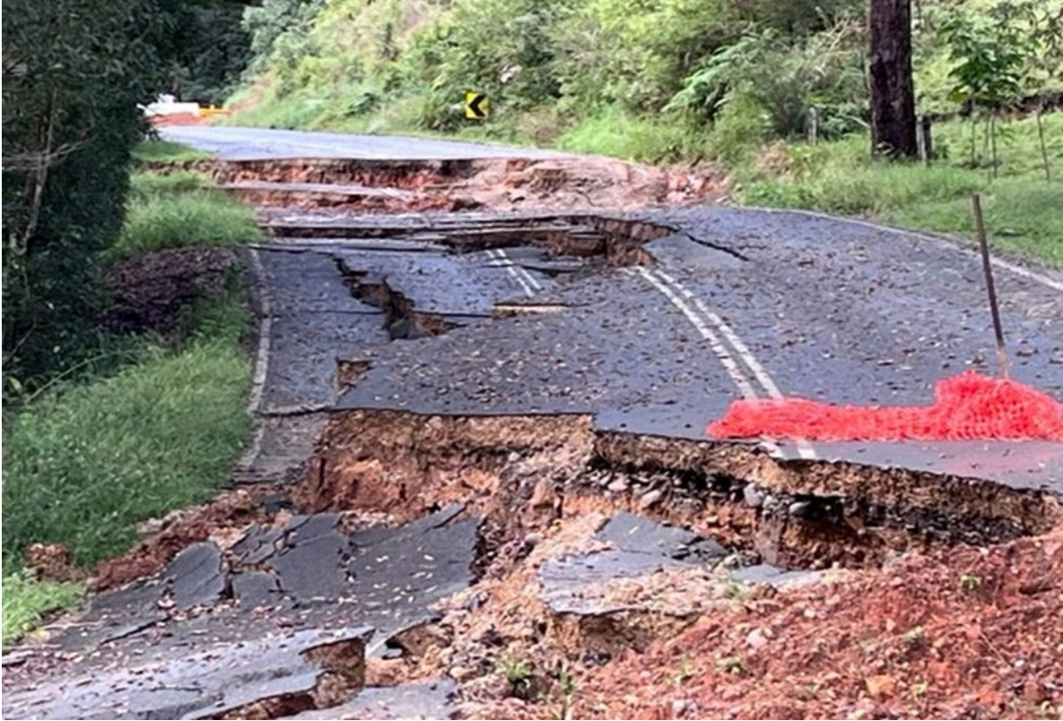
Figure 1 - Tyalgum Road