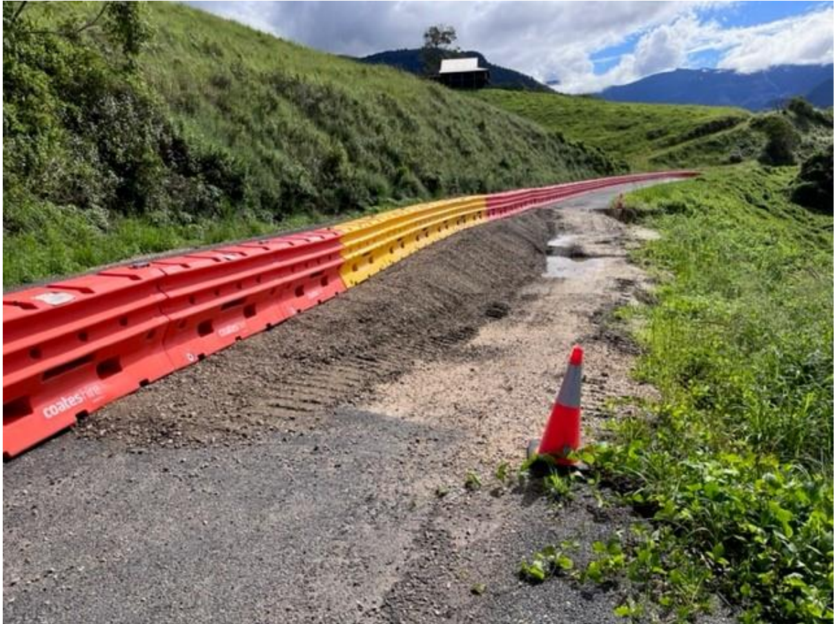
Figure 6 - Zara Road