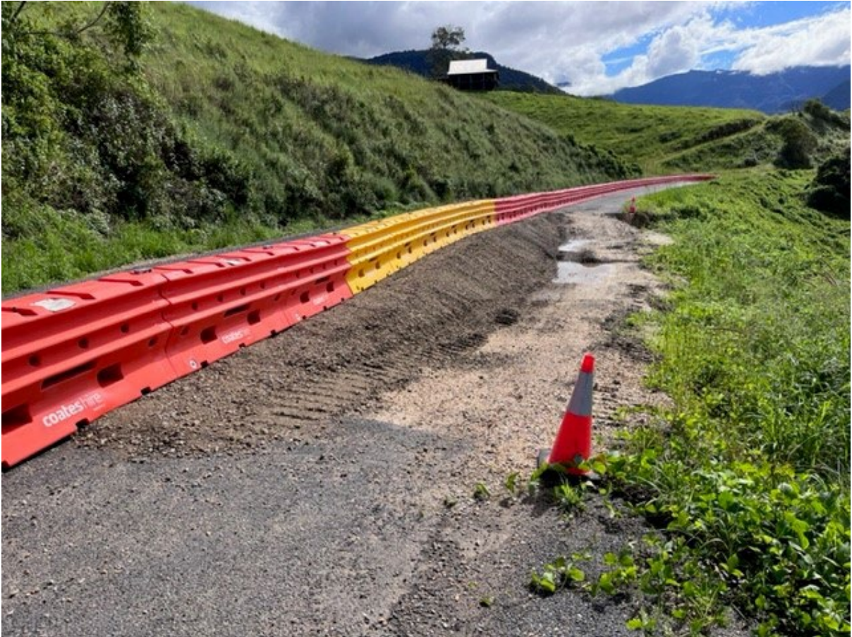
Figure 6 - Zara Road