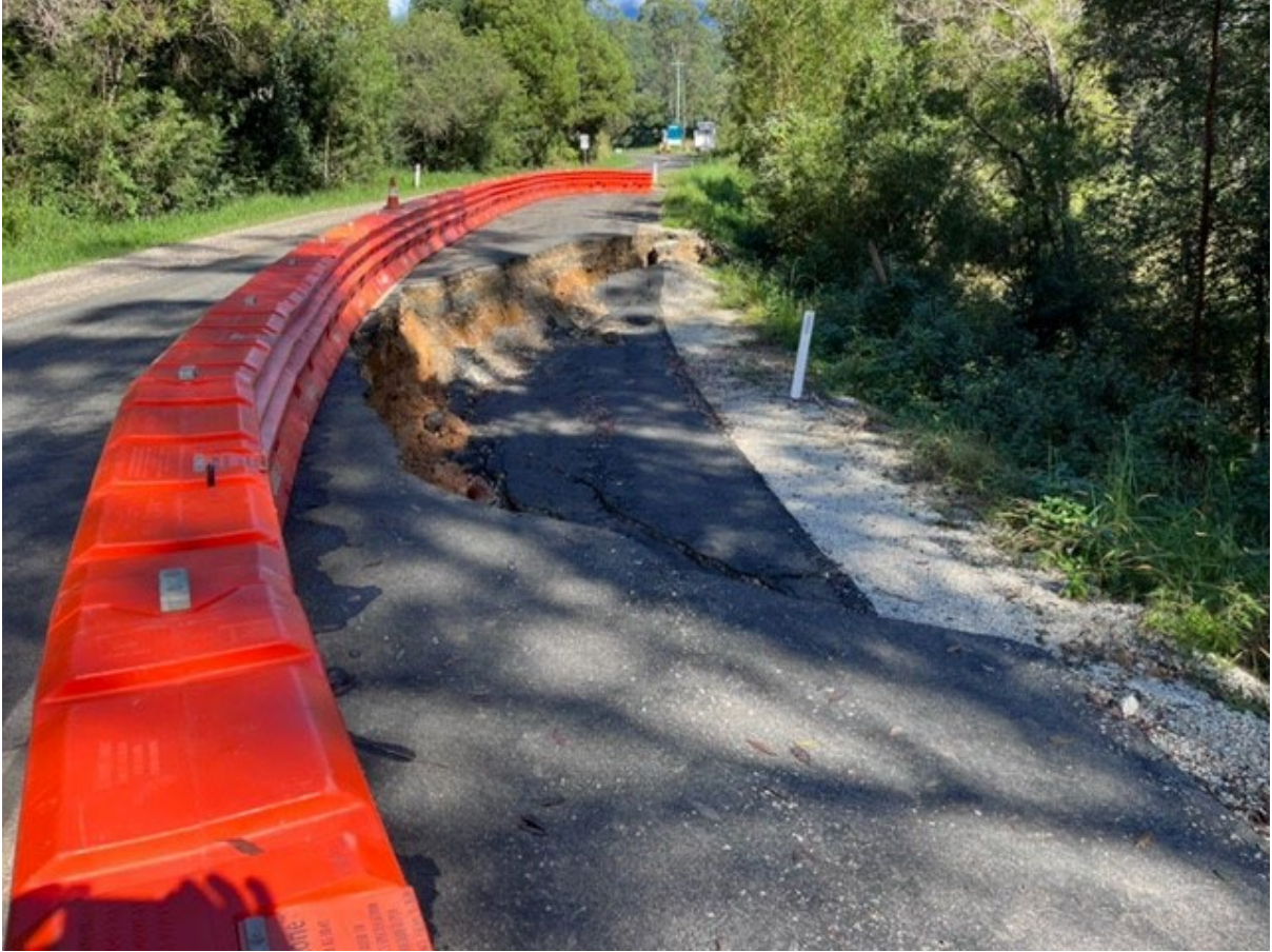
Figure 8 - Zara Road opposite Charbray Place