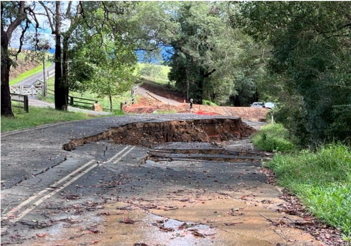
Figure 2 - Tyalgum Road