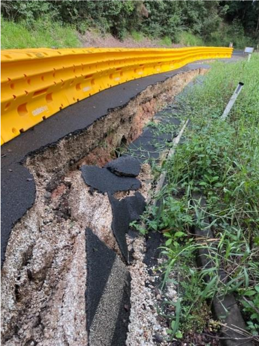
Figure 4 - Tyalgum Road