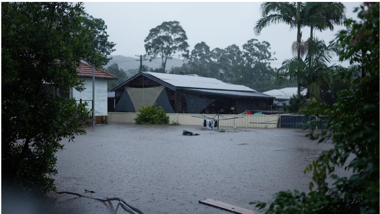
BELOW: February 28 th , on the second-floor balcony at Street, looking out to the row of houses behind us which face directly to the East Lismore Golf Course; photographed at 10:30am before the peak.