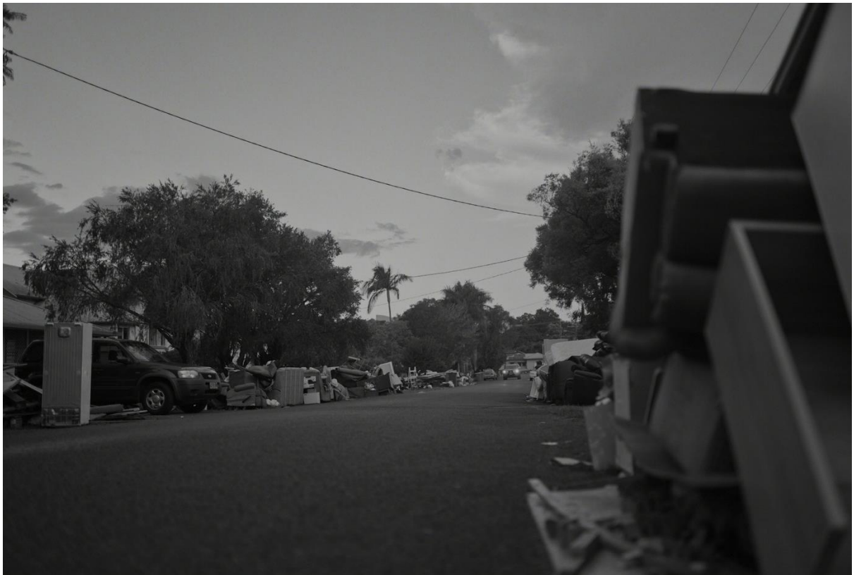
BELOW: Same as above.