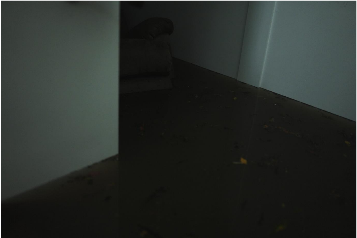
ABOVE: February 28 th , in the staircase at

Street, photographed at 10am, before the peak.