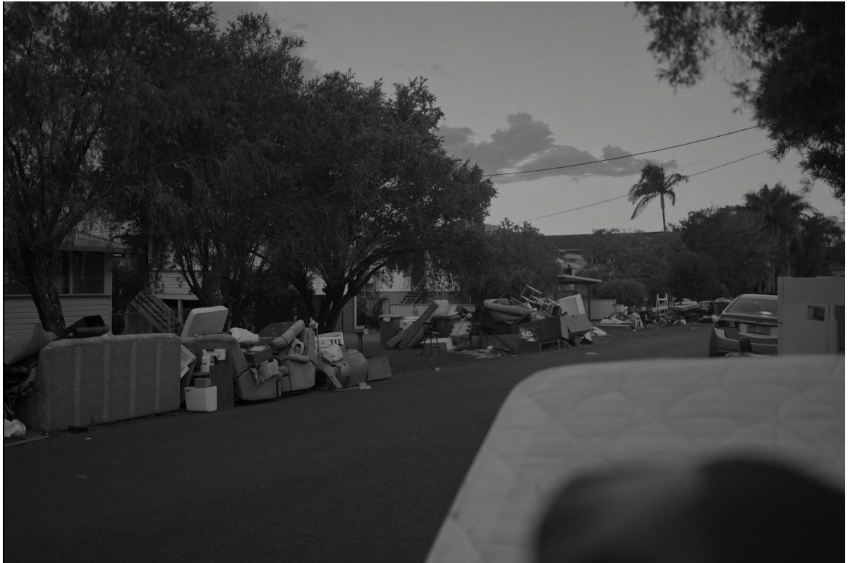
ABOVE: March 2 nd , top end of goods begins to mount.