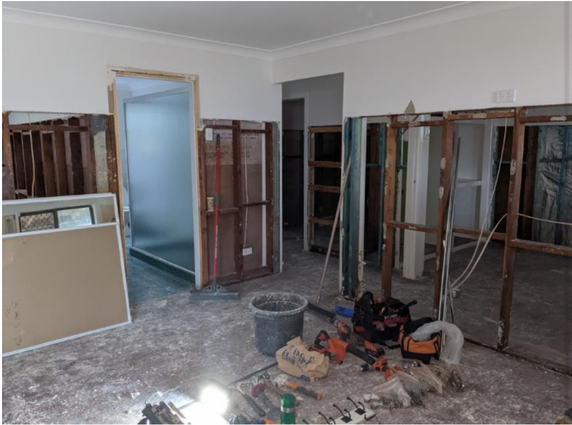
ABOVE: Approximately a fortnight after the February 28 flood, on the ground floor of , where flood-damaged walls, floors and cabinets have been removed.