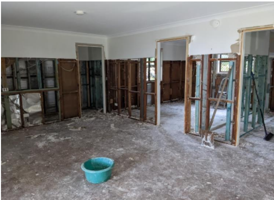
BELOW: Same as above.