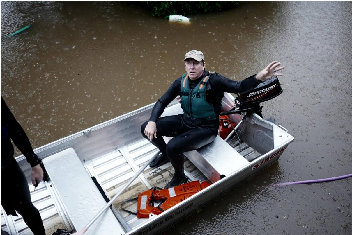
ABOVE: February 28 th , on the second-floor balcony at Street, a civilian rescuer tells us the water is still rising and nobody is sure when the peak will occur; photographed at 11:30am before the peak.