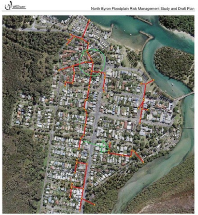
Diagram 4: Brunswick Heads main drainage features