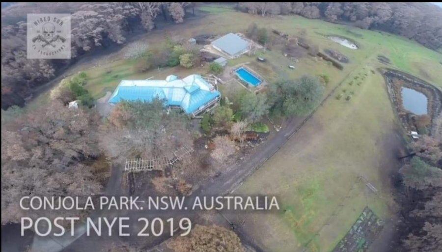
CONJOLA PARK: NSW. AUSTRALIA POST NYE 2019