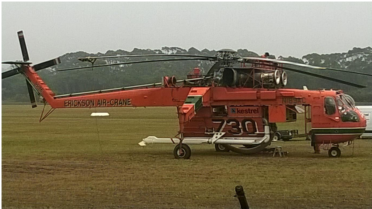
One of Several Helicopters Stationed at Merimbula in January 2020

"There is still active fire burning behind identified containment lines." This advice was issued 21 days after the major run of the fire. In the end, good luck, rather than good management would seem to have been the major factor in the extinguishment of this and other fires.