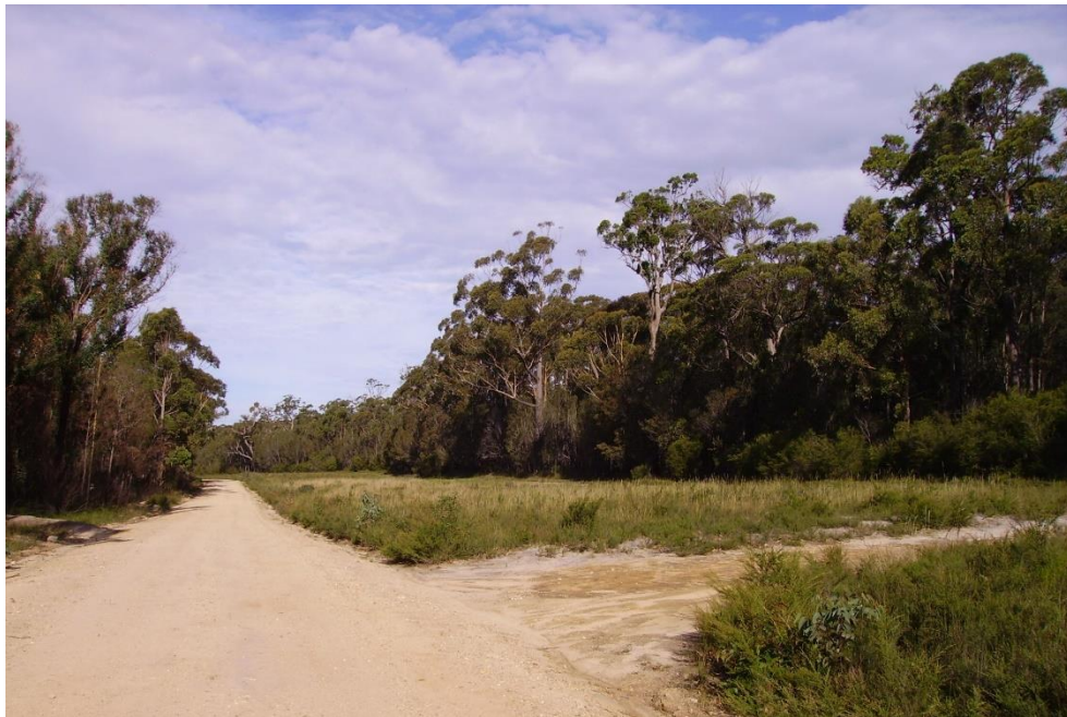
Broadaxe Road Strategic Fire Break 14 April 2020

The burn would then have extended from the Princes Highway, west along the Broadaxe Road strategic break, at least as far as the Border fire trail in Yambulla State Forest, or further west, depending on movements of the Mallacoota complex.