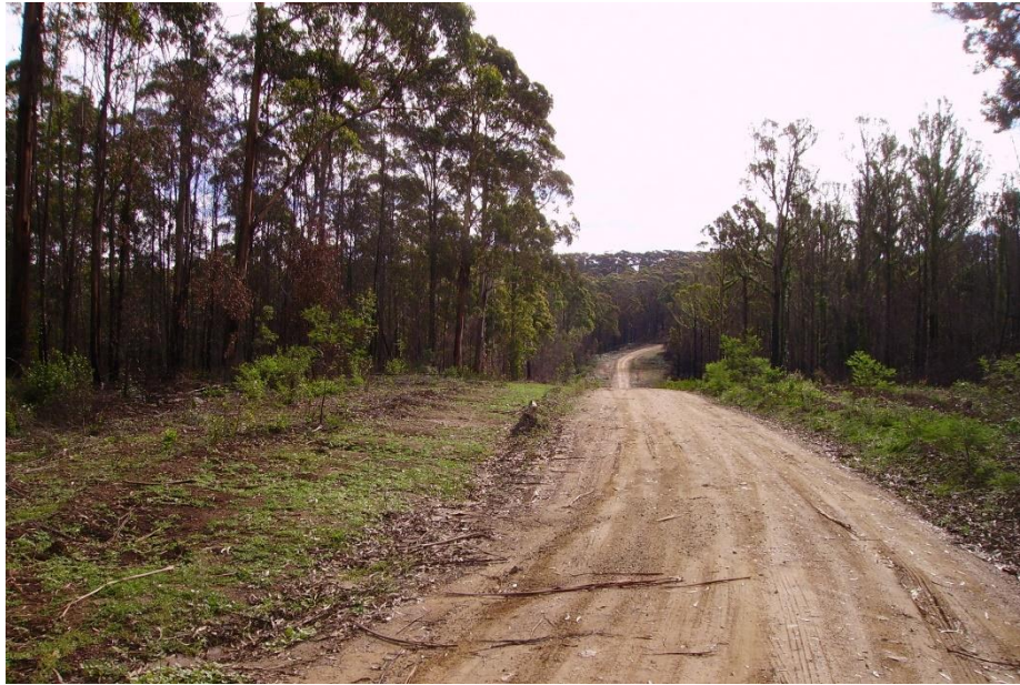
Royds Creek Road Strategic Fire Break 14 April 2020

The burn would then have extended from the Princes Highway, west along the Broadaxe Road strategic break, at least as far as the Border fire trail in Yambulla State Forest, or further west, depending on movements of the Mallacoota complex.