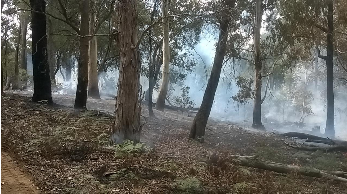
Low Intensity Fuel Reductions Leave a High Percentage of Woody Debris and Habitat Trees in Place, Compared to Wildfires.

Why does the NSW Government pay some of the research scientists noted above to provide advice to the Government and government agencies on how best to manage wildfire risk? Much of the research to date shows a lack of real understanding of fire science and potentially contributes to an increasing risk of wildfires.