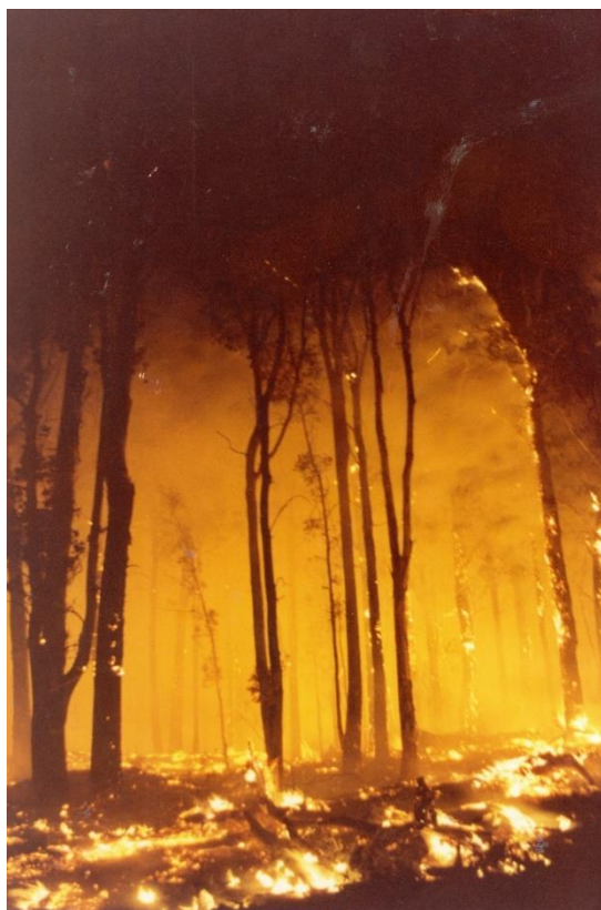
Night Time Backburn, 9 February 1983. Backburn in Heavy Fuels, to Contain a Fire Front Over 20 Kilometers North of the Victorian Border, Less than 10 Hours After a 100+ km SW Wind Change Pushed the Fire Over the Border

Throughout January, incident controllers maintained a ban on any backburning on the northern front of the Border fire. Backburning would have ensured the northern front was contained and could be blacked out. The fire front stretched from the Pacific Ocean to west of Rocky Hall. Relatively favourable (for this fire) weather, and an unknown expenditure on water bombing of the fire front by a fleet of helicopters, rather than active on-ground management, contained this fire until heavy rain covered all the fire grounds in south east NSW in the second week of February.